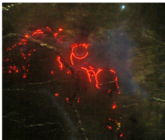
Figure 2: Cathodoluminescence image obtained of the D5 ROI in Fig. 1 (notice the bending crack for further identification) after applying electron bombardment at a voltage of 20-24 keV. As Fe is a typical quencher, the right red areas correspond to Fe-poor and Mn-rich carbonate layers that nicely mark the carbonate globule walls.

Instrumental procedure: As we were concentrated in the study of the carbonates found in our thin section (Fig. 2), we have used several SEM and microprobe to figure out the chemical composition of the globules. In particular, quantitative chemical analyses and BSE images of the carbonate globule walls were obtained using a JEOL JXA-8900 electron microprobe equipped with five wavelength-dispersive spectrometers at the UCM.